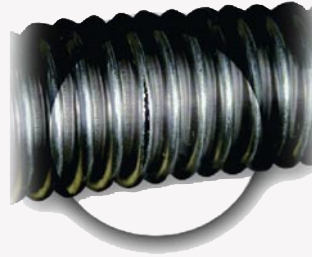
Circumferential cracks on the convolution are typically caused by high velocity flow rates

One of the most common problems associated with cryogenic hose is exceeding the recommended velocity. If you exceed the recommended velocity, damage will occur. If this is of interest, we would be happy to supply a velocity chart for our hoses.