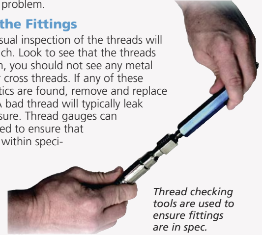
Thread checking tools are used to ensure fittings are in spec.

A simple visual inspection of the threads will tell you much. Look to see that the threads are uniform, you should not see any metal shavings or cross threads. If any of these characteristics are found, remove and replace the hose. A bad thread will typically leak under pressure. Thread gauges can be purchased to ensure that fittings are within specification.