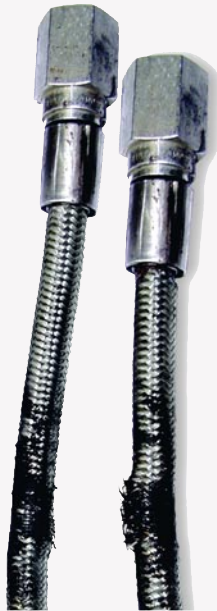
The braid on this hose was chemically attacked by an improper mixture of leak check solution.

With ethylene glycol (a common substance used in oxygen free leak check), the wrong proportions can negatively affect the stainless steel braid.