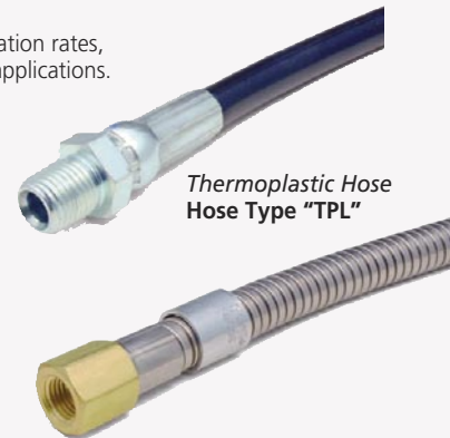
Thermoplastic Hose Type "TPL"

Durable, economical, flexible and features a low permeation rate. Not recommended for oxygen use.