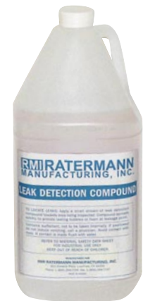
1 gal. size Pt # LC-1GAL