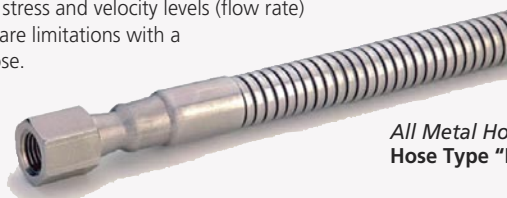
All Metal Hose Type "FPS"

All metal hoses utilize a metal corrugated inner core (typically 316 stainless steel or Monel). Metal hoses feature "zero permeation" or "no gas loss," which is very important in static gas applications. Metal hose is more costly, and is commonly used with helium and hydrogen. Monel inner core is available for corrosive type gases. Pay close attention to dynamic stress and velocity levels (flow rate) as there are limitations with a metal hose.